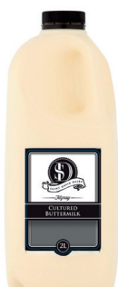
Cultured Buttermilk 2L