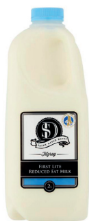
Reduced Fat Milk 2L