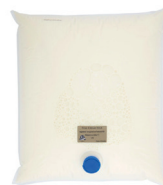
Premium Full Cream Milk 10L Bladder