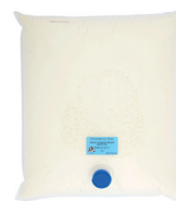
Reduced Fat Milk 10L Bladder