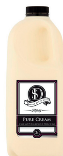
Pure Cream 2L