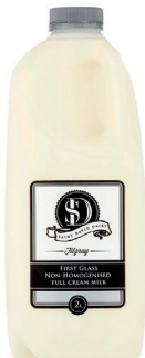
Non Homogenised Milk 2L