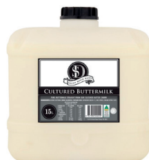
Cultured Buttermilk 15L