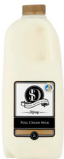
Premium Full Cream Milk 2L

Our milk matters, and this is evident amongst baristas. Our award-winning milk's body, taste and texture transforms regular into the remarkable.